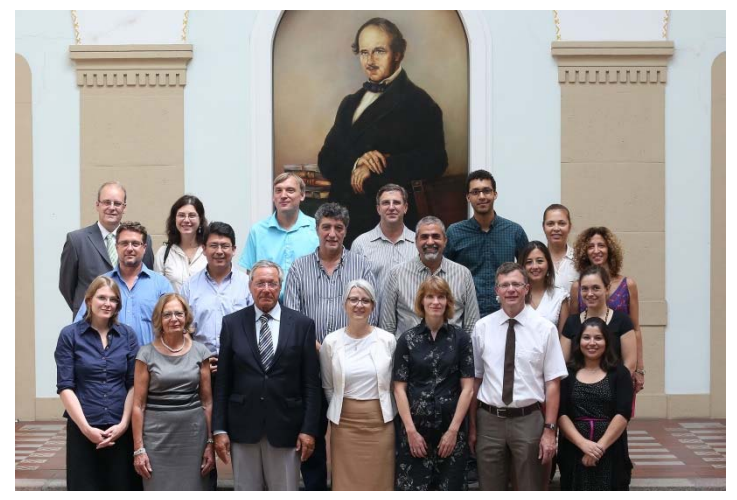
Illustration 1: Coordination meeting in Cologne.